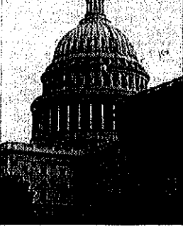
U.S. Capitol Building